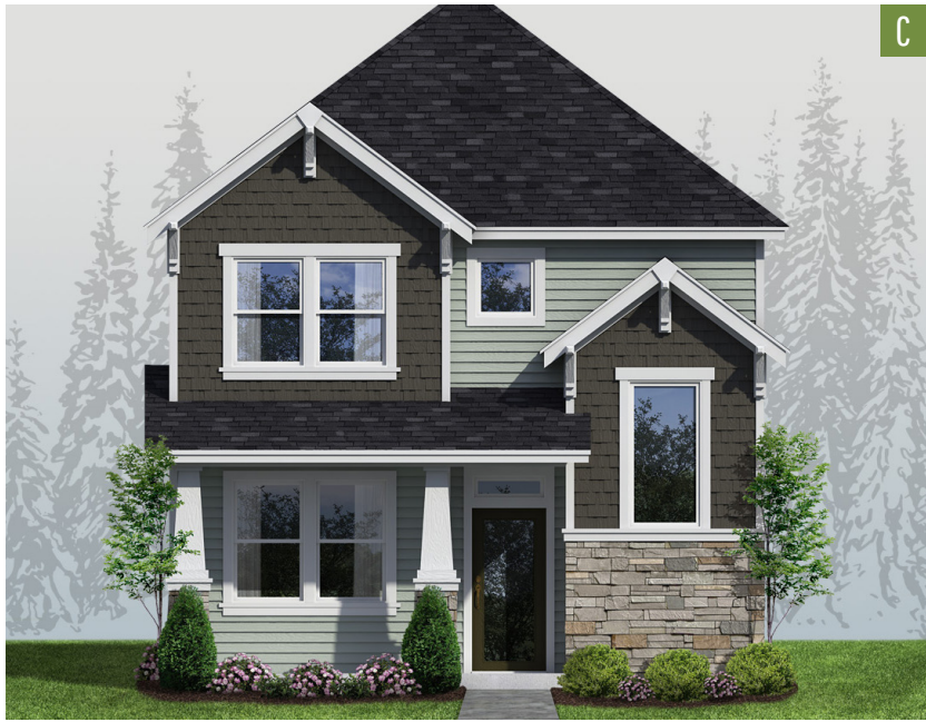
MAIN LEVEL (TOP)